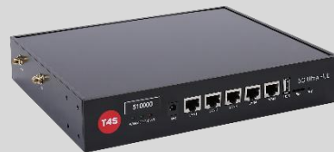
5G Ultra Hub

The items below are included in the box.