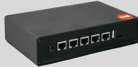
5G Vehicle Hub

The items below are included in the box.